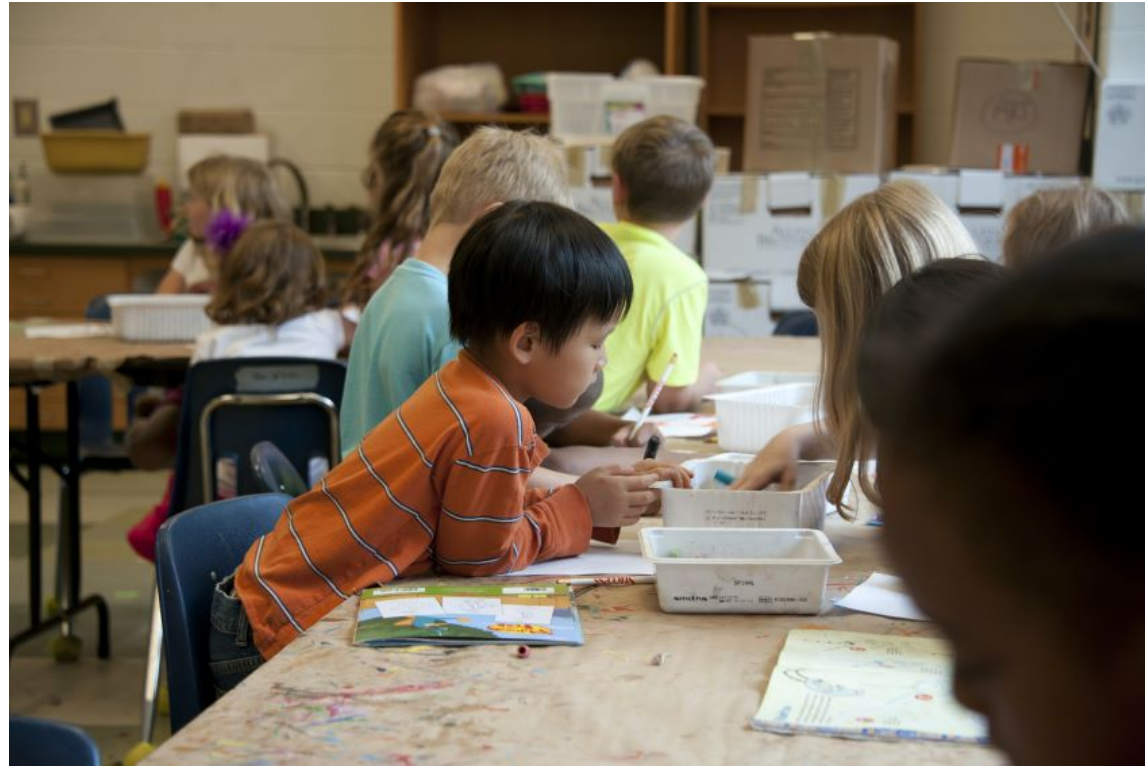
Photograph, "Students in Art Class"

Tim's favorite part of the day was art class. He loved drawing and painting best. Ms. Han told them they were going to draw a picture to show their favorite memory. Tim knew exactly what his picture was going to be about! He was thinking about how happy his mom was going to be when she saw the picture. Suddenly, across the table, Susan screamed! Tim looked up and saw a river of blue paint heading toward his painting.